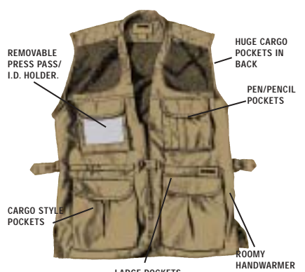
LARGE POCKETS POCKETS WITH WEATHER-TIGHT ZIPPER CLOSURES.